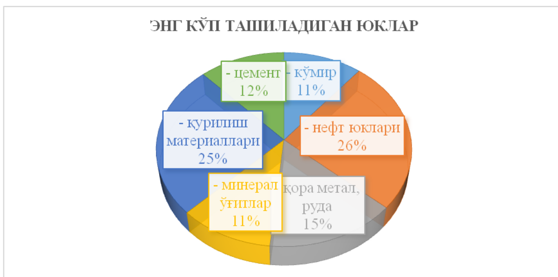
Figure 3. Most transported cargo